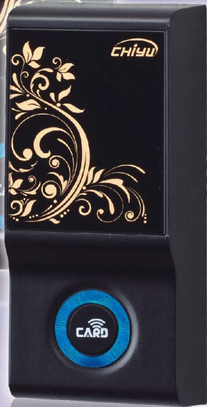
WR-E2/M2 (Black / Silver)