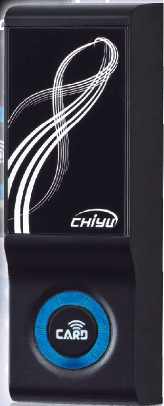
WR-E1/M1 (Black / Silver)